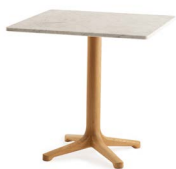
1860 / 1860ST / 1860TZ